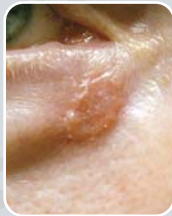
Scar before Tx