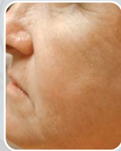
After Affirm Tx

"We've seen improvement in as little as two treatments but we tell patients it will take three to four treatments before they start to see anything."