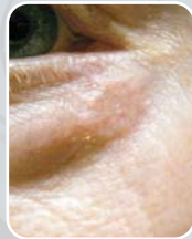
Scar after Affirm Tx

“The big differences between the Affirm and the other modalities are speed, because you treat the entire face in 15 to 20 minutes, and ease of use.”