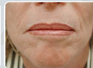
After Affirm Tx