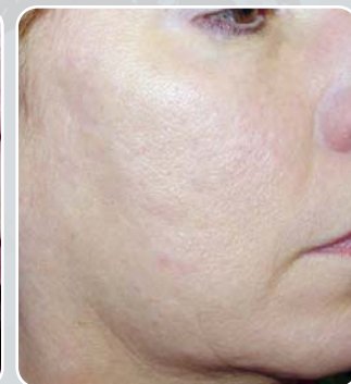
After one Affirm Tx